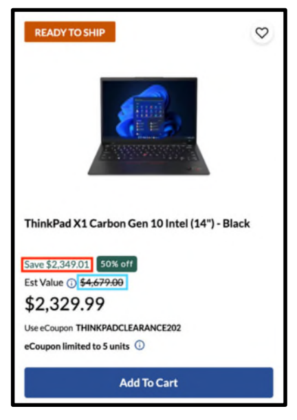
The Discount Value (red) and the Regular Price (blue) are each displayed once.

16. Once a customer clicks "Add To Cart", the eCoupon is applied and the amount the customer is saving through the eCoupon, which is the Discount Value, is displayed. The Discount Value and the Regular Price are each shown twice on this webpage, as appears on the copy of the print screen taken of the webpage and disclosed in support of this Application as Exhibit P-7, TAB B.