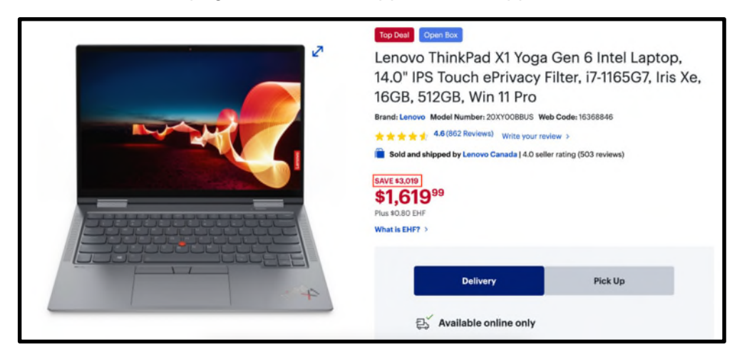
The Discount Value (red) is displayed once.

21. Once a customer selects one of the Lenovo Laptops, they are taken to a webpage where the Discount Value is again displayed, as appears on the copy of the print screen of the "After Selection" webpage disclosed in support of this Application as Exhibit P-8, TAB B.