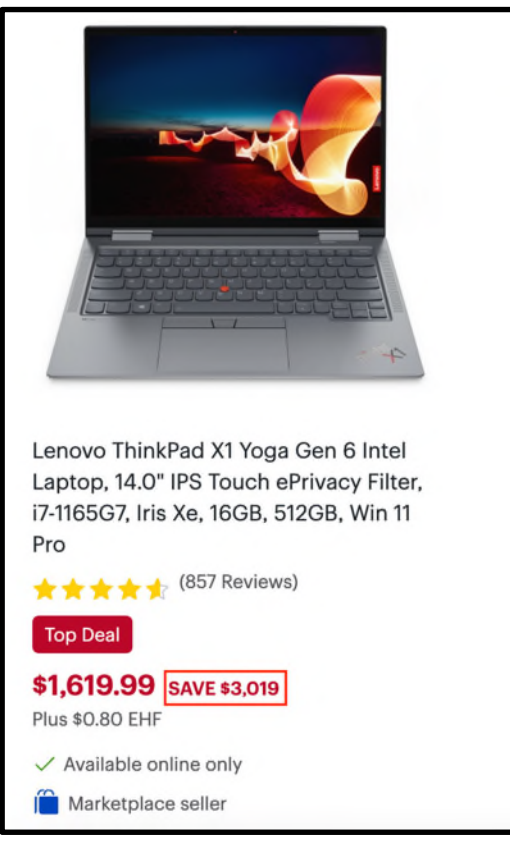
The Discount Value (red) is displayed once.

Lenovo Laptops' name and image, as appears on the copy of the print screen of the webpage disclosed in support of this Application as Exhibit P-8, TAB A .